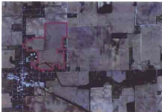
AERIAL PHOTO (N.T.S.)